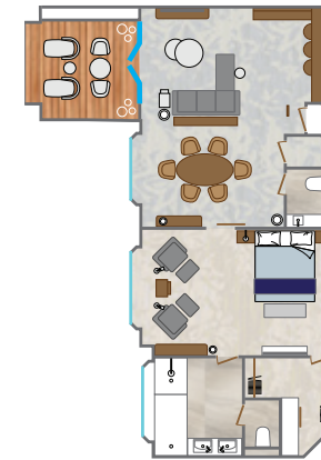
OWNER'S SUITE MIDSHIP