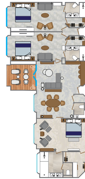
GRAND OWNER'S SUITE